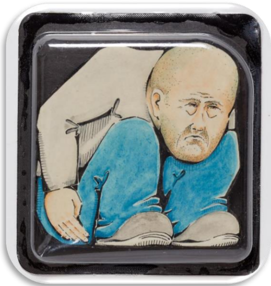
Captive West Sussex Probation Koestler Arts Platinum Award for Watercolour & Gouache 2021